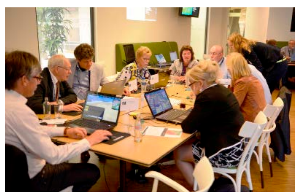
▲ Figure 1, Stakeholders examine the effects of alternative scenarios in joint sessions.

The project starts with the upload of geodata from online sources, such as cadastral data, heights and images. 3D virtual representations of buildings, water bodies, height maps and more are created from that data. Building costs, parking demands, water storage capacity, carbon emissions, ownership details, other rights holders and many other parameters can be attached to each of those objects. Whenever stakeholders modify or move objects, the platform automatically calculates the effects on the parameters. In such a parametric model, road capacity can be increased by widening the roads for example. This will use more asphalt and reduce green space. Together, the two have a negative impact on heat stress and liveability. The widening of the road also requires involvement of the owner.