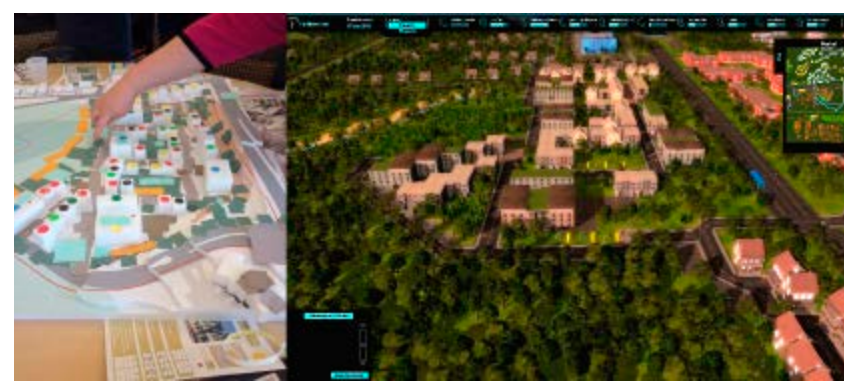
▲ Figure 3, A spatial development project in Tarrytown, where citizen participation greatly contributed to reaching a consensus.

The Tygron Engine is linked to Esri's ArcGIS for data visualisation and datasheet creation. The 3D representations are vector-based and thus allow realistic visualisations. Stakeholders add specific data, such as scenarios and options - parameters like the ones discussed above – and relationships to other stakeholders. During joint sessions, stakeholders implement alternatives to which the other stakeholders may respond (Figure 1). As the alternatives are explored, the plans can be adjusted in line with new insights or new developments. Throughout the sessions, the stakeholders gain a better understanding of their own and the other stakeholders' roles. They negotiate and implement their plans and receive feedback on the effects. The platform speeds up the spatial development process, thus benefiting all parties. The results are saved and