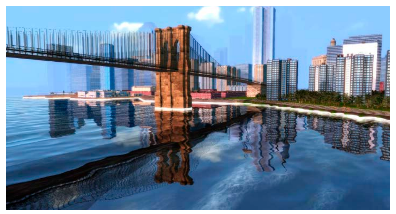
▲ Figure 2, Visualisation of Lower Manhattan, created in response to Hurricane Sandy.